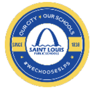
Vashon High School